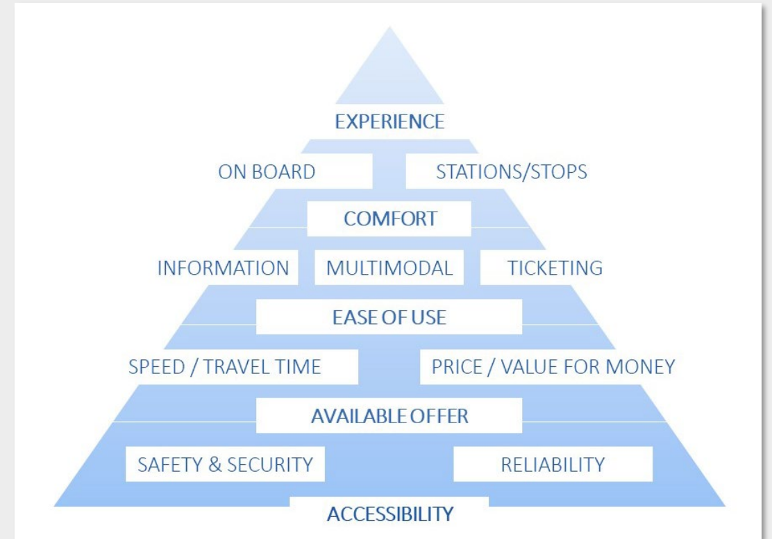
Maslow's pyramid, applied to public transport (CIPTEC, Peek and van Hagen)